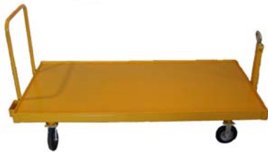
Flat top reverse pull