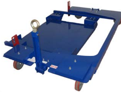
Mother, child cart