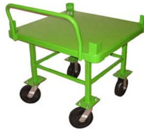
Child push cart