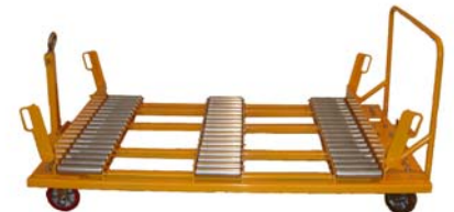
Static roller deck