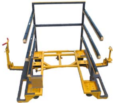
Caster quad fascia cart