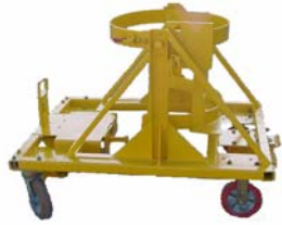
Barrel flip cart