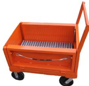
Roller deck flip down door