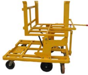
Manual tilt table