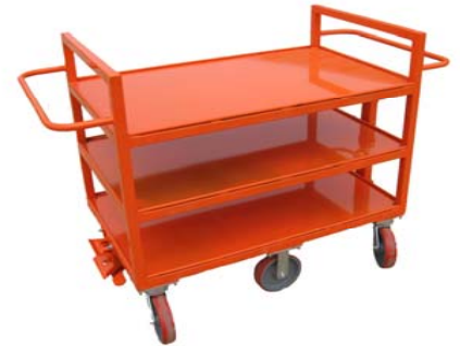
6 wheeled hat